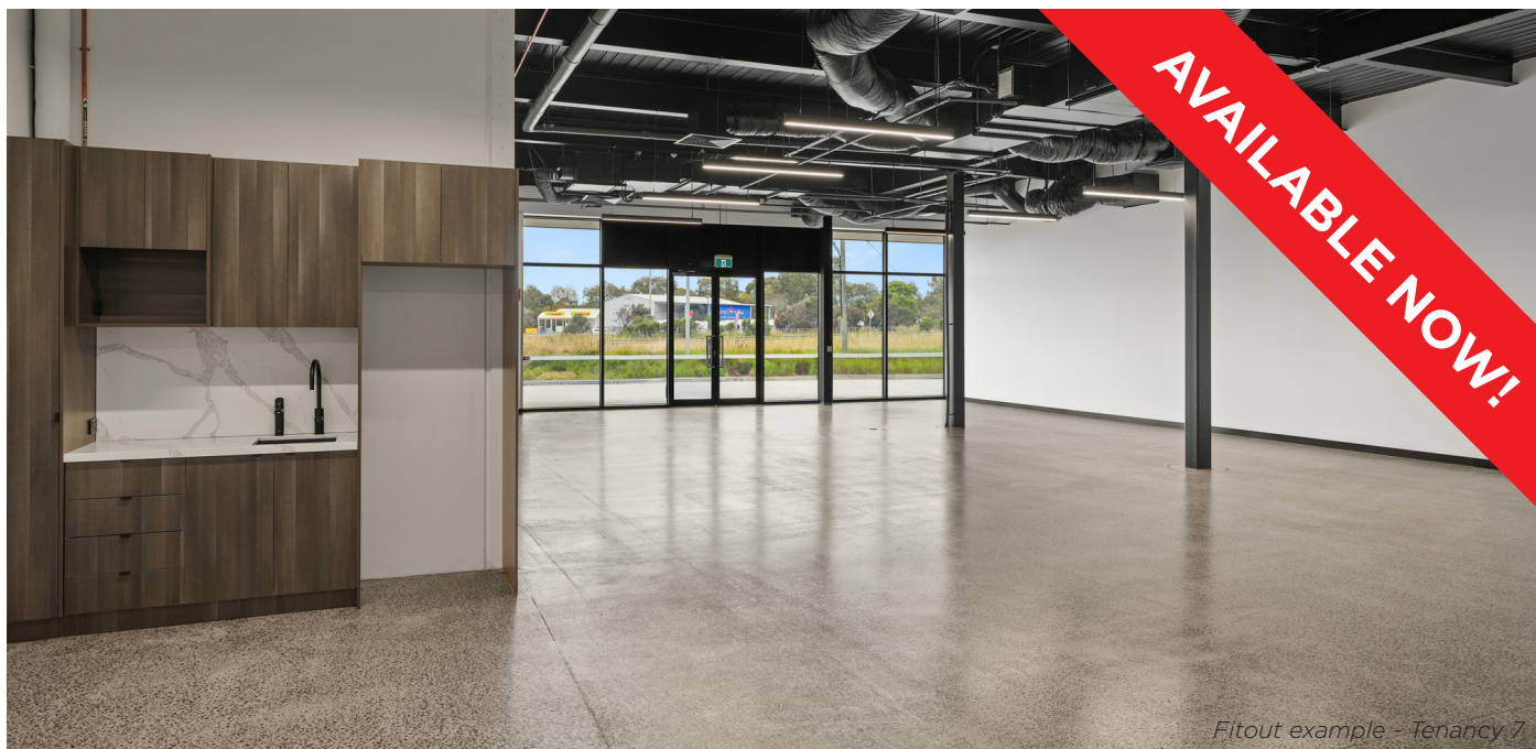
Fitout example - Tenancy 7